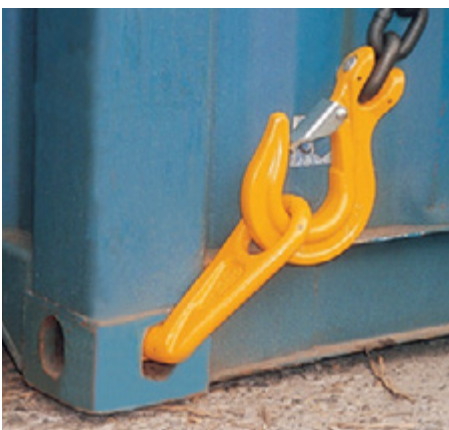
Figures 2 & 3: Typical Side Lifting Lugs, showing top and bottom arrangements.

Note: with certain types and/or size of container it is not permitted to use this method of lifting. For further guidance refer to tables 1, 2, and 5 of ISO 3874