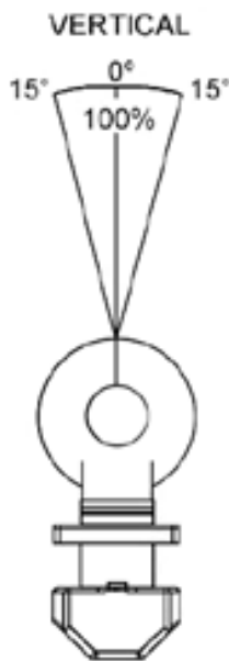
Figure 4: Top lug lifting tolerance

This type of container lifting lug is designed to be lifted from the vertical with an allowable tolerance of 15 degrees about the axis of the eye only, see figure 3. This means that they must be used in conjunction with a lifting frame and sling set. It is also recommended that the vertical slings on the frame are connected to the lug by means of a shackle with a nut, bolt and cotter pin to prevent shackle pin coming loose during the lifting operation.