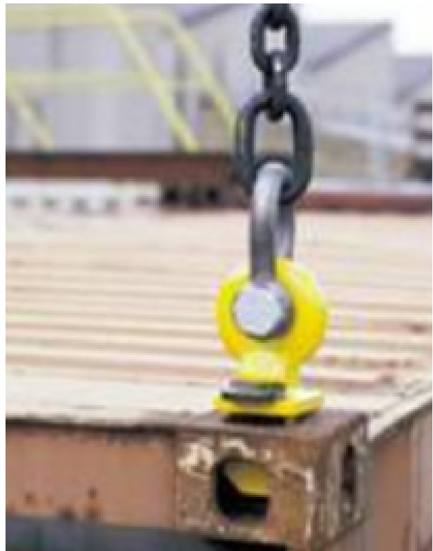
Figure 1: Typical top lifting lug (yellow)

As the name suggests these lugs are designed to be fitted to the top of an ISO corner casting. They are generally designed such that they can be inserted into the slot on the top of the corner casting, then to secure they are twisted through 90 degrees and retained by a locking device. This particular type is commonly designed to be fitted to a vertical sling, therefore using this method of connecting the load to the appliance will also require some sort of lifting frame and sling assembly. See figure 1 for a typical example of a top lifting lug.