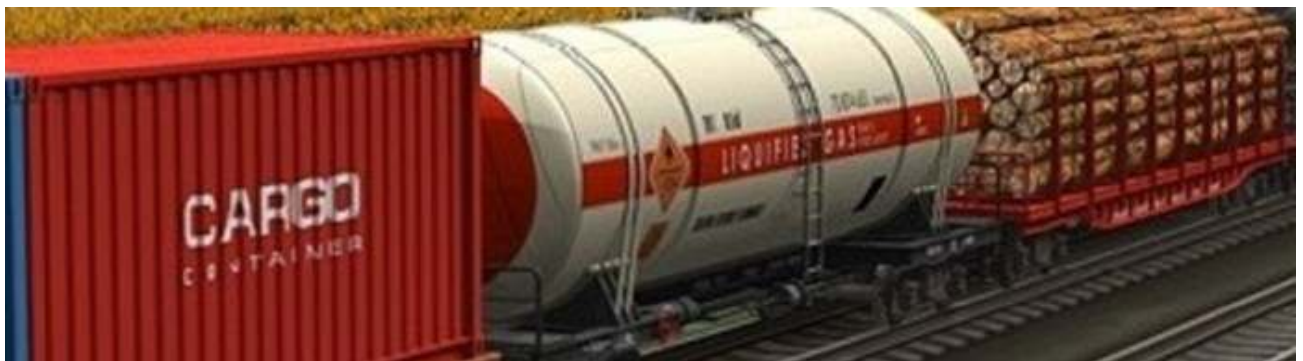
Image used for representational purposes only (Image Courtesy: FIATA) FIATA International Federation of Freight Forwarders Associations and the International Cargo Handling Coordination Association (ICHCA) have renewed their Memorandum of Understanding (MoU) to reinforce collaboration between the two organizations. A signing ceremony took place online today and was attended by FIATA and ICHCA representatives, as well as respective members.

FIATA represents the freight forwarding industry by advocating trade facilitation policies and promoting best practices in the supply chain to speak with a unified voice in support of freight forwarding associations and logistics companies. ICHCA is dedicated to improving the safety, security, sustainability, productivity and efficiency of cargo handling and goods movement by all modes and through all phases of national and international supply chains.