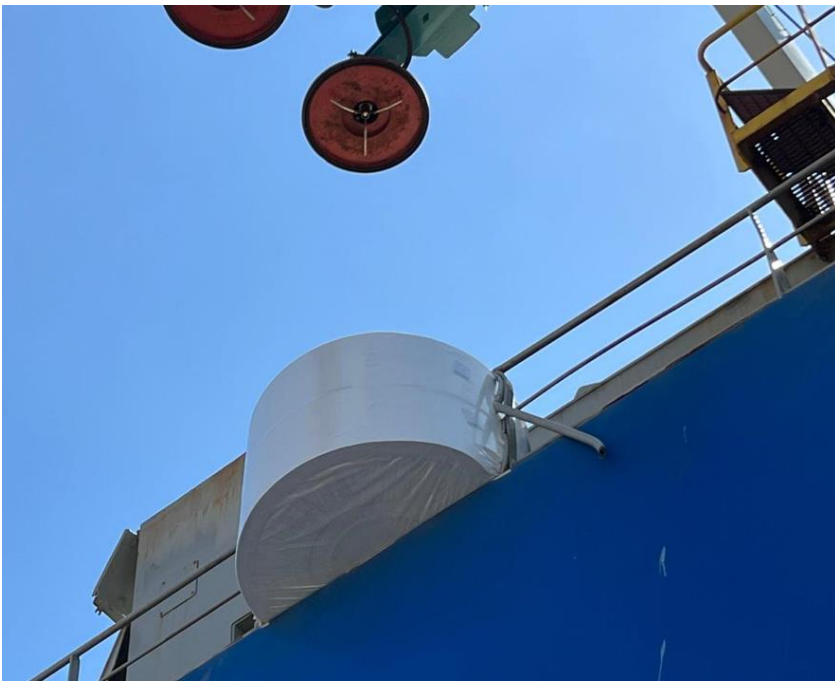
Some reels dropped down on the vessel, some landed on the quay.