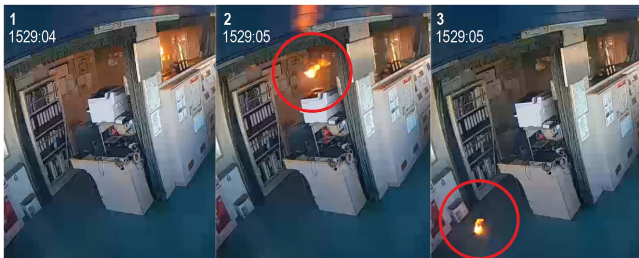
Figure 5. Photos from the bridge closed-circuit camera showing (1) a second explosion, (2) an object on fire propelled into the air (circled in red), and (3) the object, still on fire, landing on the floor (circled in red).

In the video, the fire on the communications table continued to grow. The visibility on the bridge decreased rapidly, and the camera lens became covered in ash and started to deform at 1536:26, preventing any further view of the fire within the bridge.