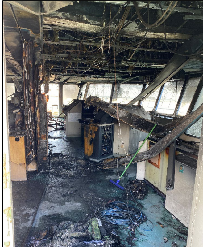
Figure 3. The damage to the bridge.

At 1527:54 local time, the footage showed an orange flash immediately followed by a puff of smoke by the communications table. Following the initial flash, the video showed smoke rising up and increasing in volume and thickness.