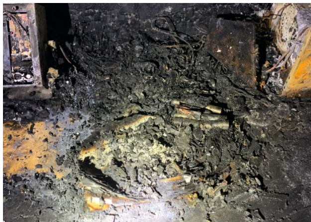
Figure 7. The remains of the lithium-ion and nickel-metal hydride battery chargers on the communications table.

All six of the nickel-metal hydride battery cells were found among the charger remains and exhibited fire damage. Of the remains of the two lithium-ion batteries on the communications table, two cells from the same battery were found among the charger remains and had sustained fire damage. Although investigators found components of the second lithium-ion battery among the charger remains, its two cells were not found.