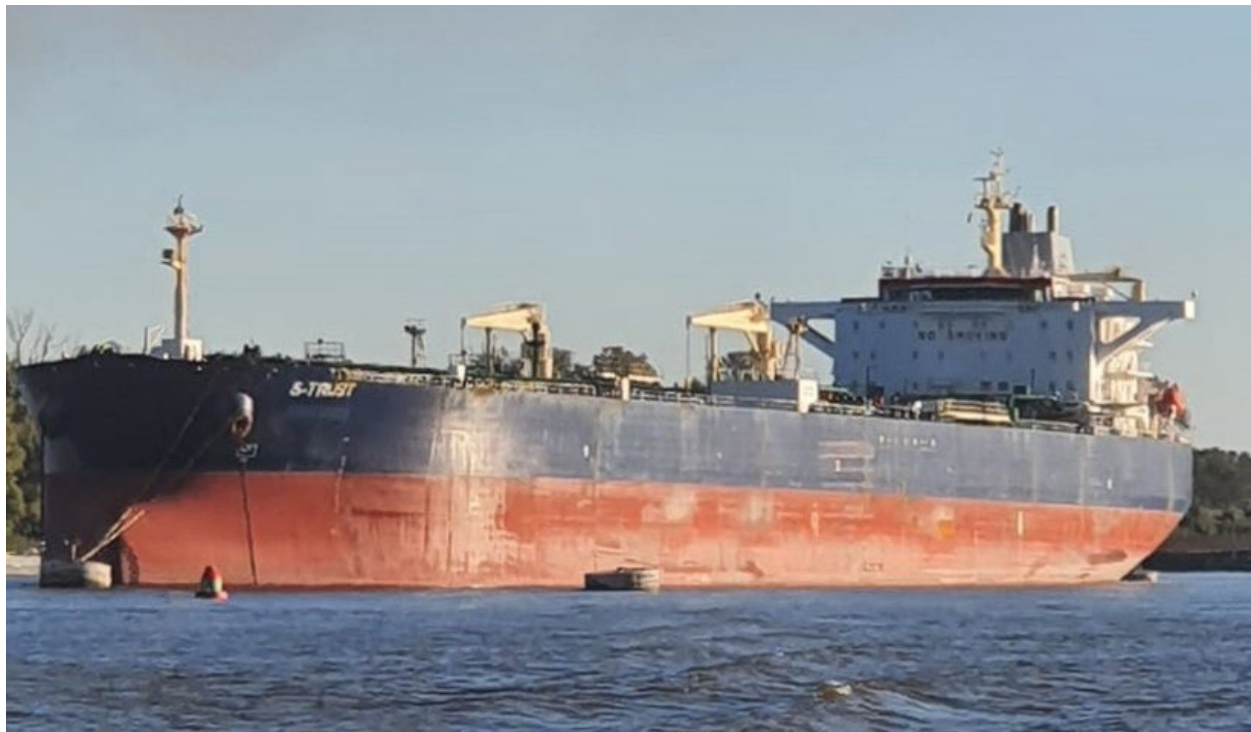
Figure 1. S-Trust at anchor following the casualty.

On November 13, 2022, about 1530 local time, a fire started on the bridge of the oil tanker S-Trust while the vessel was docked at the Genesis Port Allen Terminal in Baton Rouge, Louisiana. 1 Fire teams from the vessel's crew extinguished the fire about 1550. There were no injuries, and no pollution was reported. The damage to the vessel was estimated at $3 million.