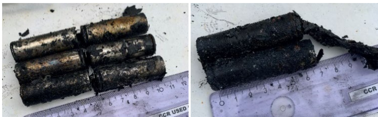
Figure 8. The nickel-metal hydride battery's cells ( left ) and remains of the lithium-ion battery cells and components ( right ) found on the communications table.