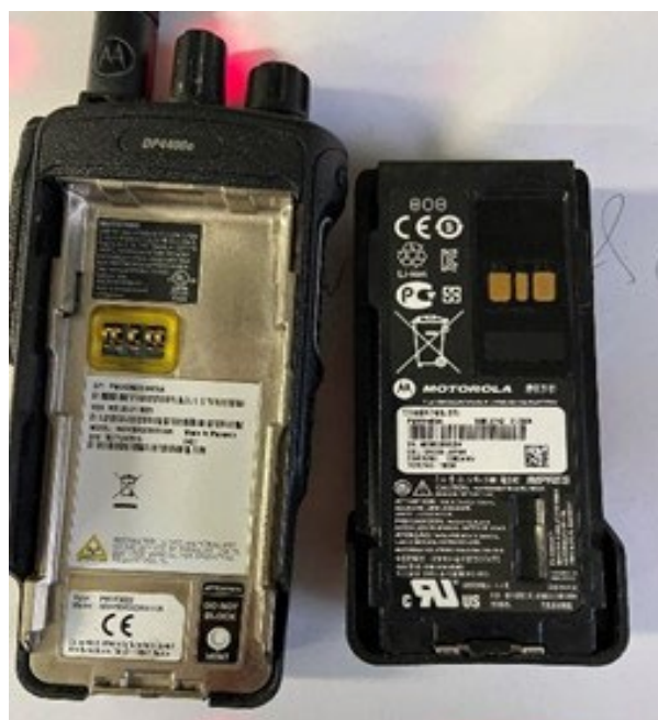
Figure 6. A Motorola DP4400e radio and lithium-ion battery used on the bridge of the S-Trust .

A postcasualty battery inventory identified that the vessel carried twenty-seven 7.4-volt batteries for the radios: 14 of the batteries had lithium-ion cells, and 13 of the batteries had nickel-metal hydride cells. The vessel also had 16 battery chargers: 8 for lithium-ion batteries and 8 for nickel-metal hydride batteries; 6 of the lithium-ion chargers were Motorola