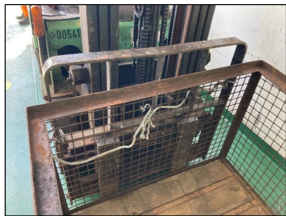
Figure 1: A simulation of how the basket was tied to the FLT. In this photograph, the rope had already parted

At about 1545, the bosun brought the forklift truck (FLT) to the location, fitted with a steel basket on its forks. The AB climbed inside the basket, which was tied to the FLT with a polypropylene rope 6 ( Figure 1 ). At approximately 1550, the bosun lifted the AB, who was standing in the centre of the basket, to a height of approximately 4.5 m from the deck.