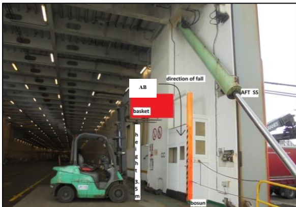
Figure 2: Simulation of the FLT set-up, indicating the height of the basket from the main deck

As soon as he shifted his position, the rope securing the basket to the FLT broke, and the basket toppled over with the AB. The AB and the basket fell from a height of about 3.5 m ( Figure 2 ) to the deck, just missing the bosun.