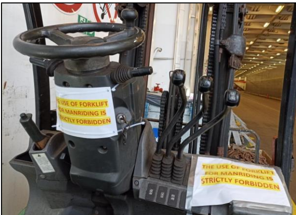
Figure 3: Signs posted on the FLT on board Opaline